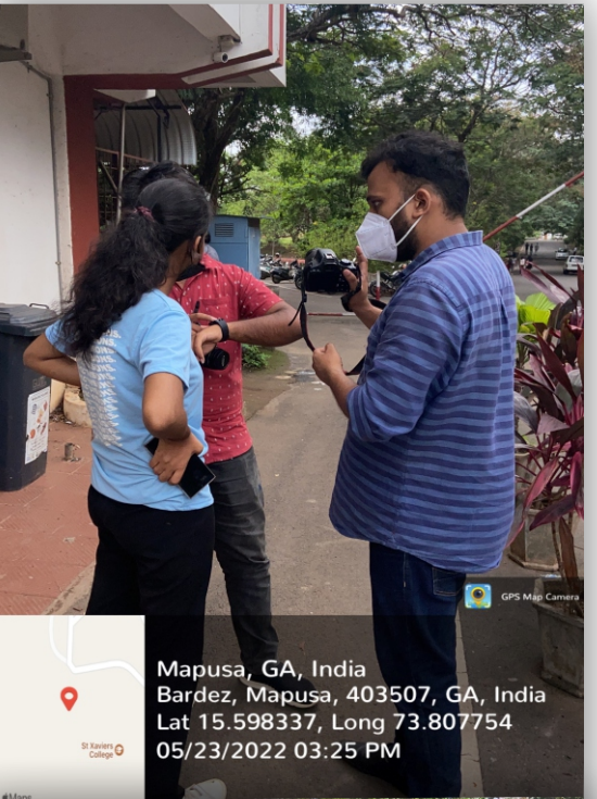
Mapusa, GA, India Bardez, Mapusa, 403507, GA, India Lat 15.598337, Long 73.807754 05/23/2022 03:25 PM