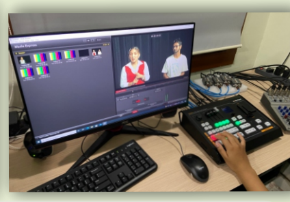
AV MATRIX - vision Mixer model no. VSO605U