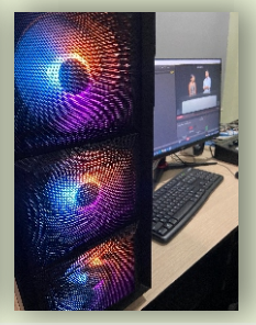
Video Editing Workstation Intel Core i7 (10 Gen)