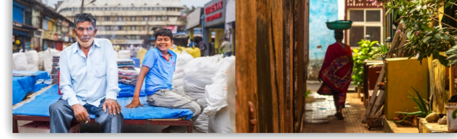
Photo Walk 2022, SY

For photography pros and amateurs alike, a photo walk is a meditative experience that is sure to get you moving, and connect you with the world and your surroundings, all while allowing your creativity to roam free.