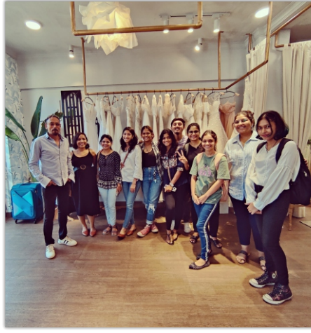
brides are first placed in different mocks

advisable for maximum privacy. After a brief digression about how the age of Pinterest wedding mood boards had disrupted the creative process for designers and customers alike, he spoke about how to-be