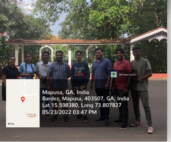
Mapusa, GA, India Bardez, Mapusa, 403507, GA, India Lat 15.598380, Long 73.807827 05/23/2022 03:47 PM