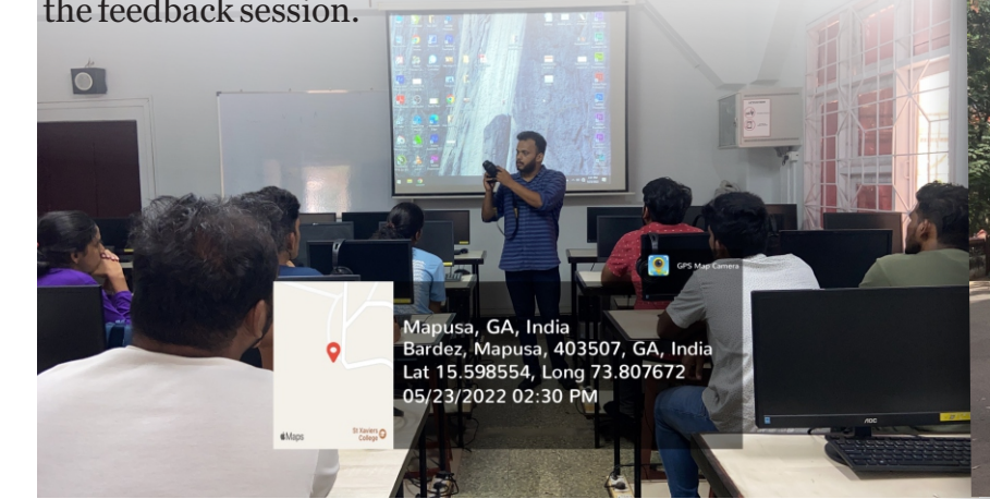
Mapusa, GA, India Bardez, Mapusa, 403507, GA, India Lat 15.598554, Long 73.807672 05/23/2022 02:30 PM