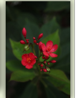
Pratik Kharate FYBA- Mass Communication